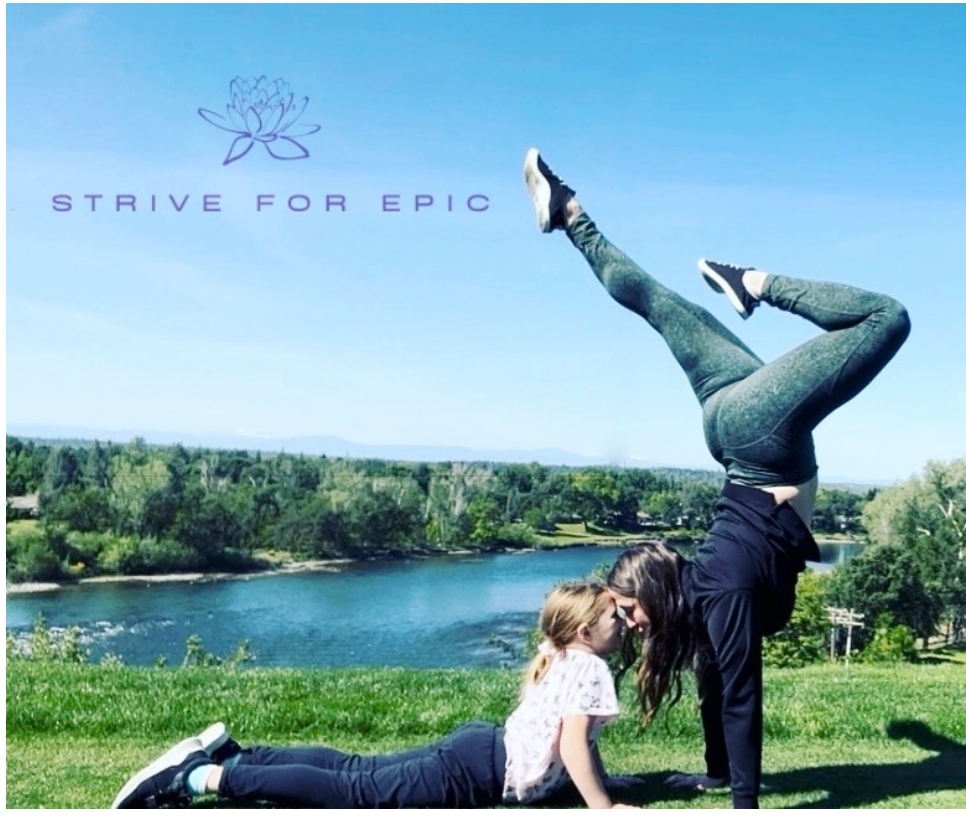
[ Article originally appeared in www.norcalsbdc.org ]

A young woman with a passion to connect people through yoga saw an opportunity to transform the hobby she loved into a thriving business.